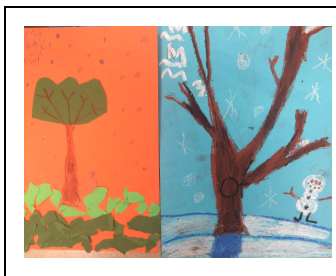
1st Grade Grandma Moses Trees