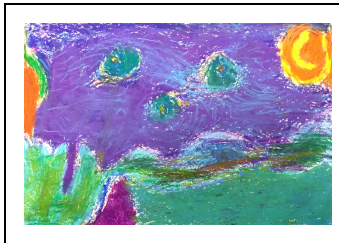
WARM AND COOL COLORS BY GIANNA IN PURPLE TEAM, 2ND GRADE