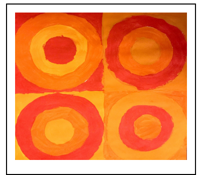
ANALOGOUS COLOR BY ANDY IN BLUE TEAM, 5TH GRADE