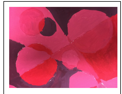
MONOCHROMATIC COLOR BY MADDY IN PURPLE TEAM, 4TH GRADE

Heritage Lakes PE is on Twitter! Follow us @HeritageLakesPE